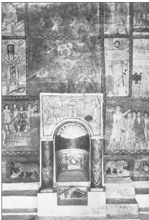
Figure 5. a. Baptismal font on the western wall of the baptistry in the Christian building at Dura Europos.