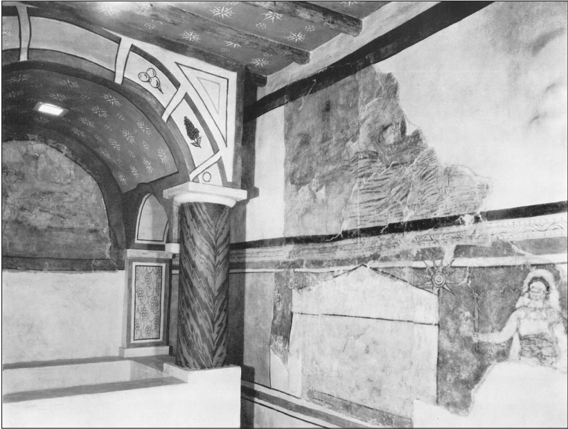
Figure 4. The Procession of Women and the font in the baptistry of the Christian building at Dura Europos.

structure, thought to represent a tomb, immediately to the right of the font. This would certainly suggest a connection between baptism and the dead who are to emerge from the grave. 30