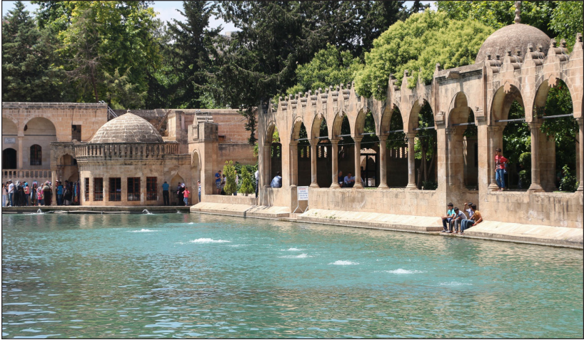
Figure 1. Balıklı Göl (Abraham's Pool) at the site of ancient Edessa, now Urfa, Turkey. Now located inside a mosque, this is said to be the site of a miracle in which God delivered Abraham from burning by turning the flames into water.