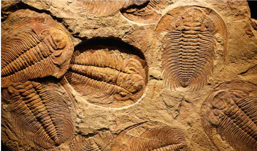
Fossils Trilobite Imprints in Sediment

plants or animals. These primitive species were aquatic; land forms were of later development. Some of these simpler forms of life have persisted until the present time, though with great variation as the result of changing environment.