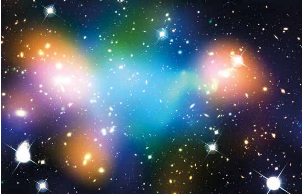
View of Galaxy Cluster Abell 520 from the Hubble Space Telescope

the spirit may be hindered, hampered, and interfered with through influences of heredity, through prenatal defects, or through accident and disease.