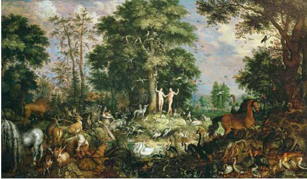
Garden of Eden , Roelandt Jacobsz Savery, 1576-1639

those who would make man but little above the brutes when in truth he is but little below the angels and if faithful shall pass by the angels and take his place among the exalted sons of God. The spirit of man is the offspring of the Eternal Father, and his body, if unmarred, is in the very form and fashion of that spirit.