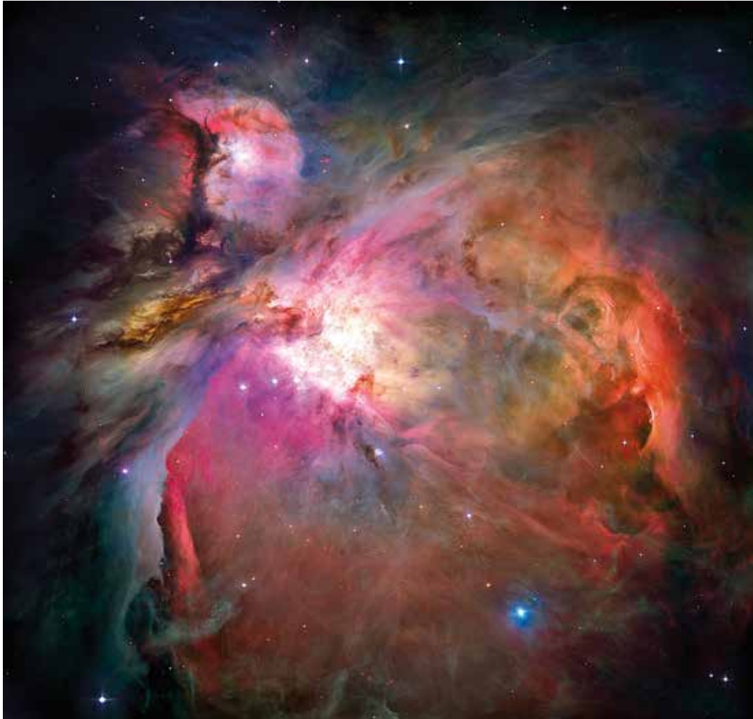
View of the Orion Nebula from the Hubble Space Telescope

It is not enough to refer effects to the First Great Cause; it is unsatisfying and not always reverent to answer questions as to how things came to be what they are by the easy statement that God made them so. With such an answer the scientific man has little patience. The fact that all created things are the works of God and that all processes of nature are due to Him as the administrator of law and order is to the scientific mind an axiom requiring neither argument nor demonstration. The botanist knows that God makes the plant grow, but he, weak mortal, is devoting time and energy of body, mind, and spirit to a study of the way in which God works such a marvelous miracle. The geologist knows that God created the earth, but the best effort of his life is put forth in the hope of finding out in some degree, however small, the method by which the Creator wrought this wondrous world. The astronomer gazing into the starry depths sees in their orderly procession the Lord Eternal walking in His majesty and might, and in humility the student of the heavenly bodies spends days and nights striving to learn a little of the way in which God worked out the marvel of the universe.