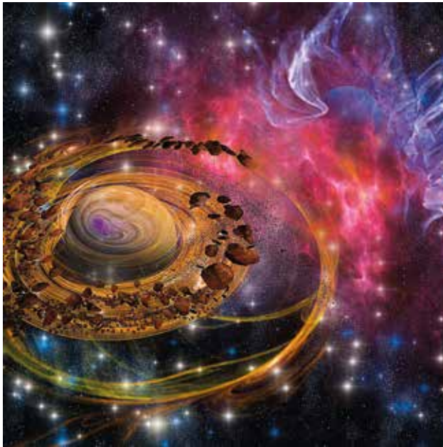
Artist's Depiction of Planet Formation

Within were stairs that scaled the eternities above, that descended to the eternities below; above was below, below was above to the man stripped of gravitating body. Depth was swallowed up in height insurmountable; height was swallowed up in depth unfathomable. Suddenly, as thus they rode from infinite to infinite,