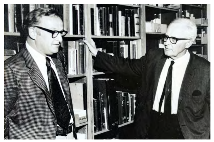
Figure 2. "I was deeply impressed with his intelligence and the depth of his learning, as well as by the fact that he made no effort to disguise his faith." <sup>34</sup>

It would not be an understatement to say that I was deeply impressed with his intelligence and the depth of his learning,<sup>4</sup> as well as by the fact that he made no effort to disguise his faith. He could play the academic game as well as or even better than the most skeptical critic along the Wasatch Front. Though he was not a stereotypical Saint, at that moment he became for me a role model.