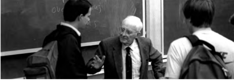
Figure 2. “Most of the time he talks as if everyone present has just read everything he has.” 8