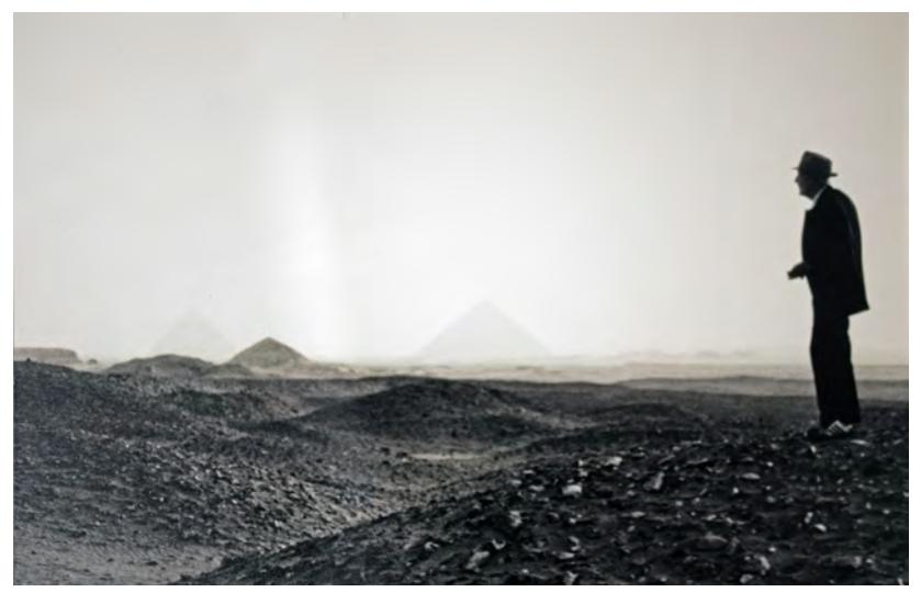
Figure 6. "In the desert we lose ourselves to find ourselves." 102

To discover that one is nothing is the first step to breaking loose [as per King Benjamin's address].<sup>91</sup>