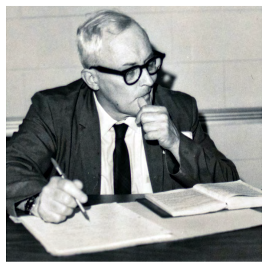
Figure 3. Nibley "pretends a playful ignorance."99

What Nibley is doing, of course, is re-creating the world of Jerusalem as it very likely was six hundred years before the birth of Christ.