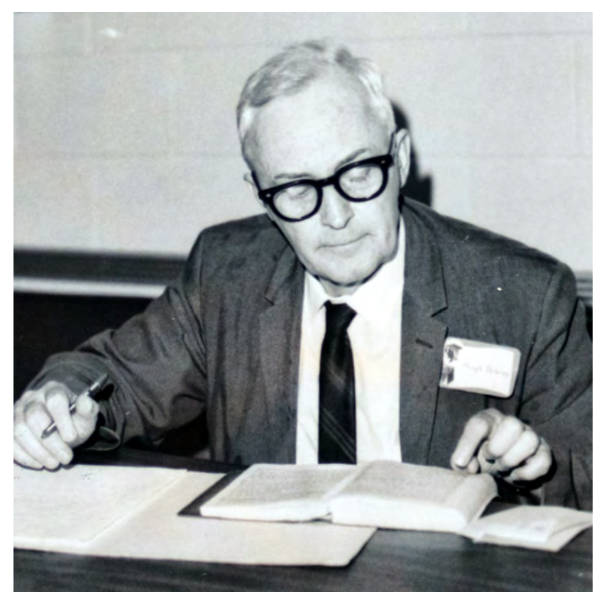
Figure 2. "The thing that welds Hugh Nibley to my mind and heart is our mutual love of the Book of Mormon." 98

world, the realities they know—and the greatest of these are "power and gain." <sup>14</sup>