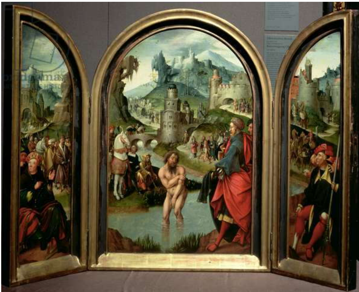
Figure 1. Cornelis Engelbrechtsen (1468-1533): Triptych of the Cleansing of Naaman: the center panel depicts Naaman, commander of the Syrian army, washing in the River Jordan to cure his leprosy at the command of the prophet Elisha, who in the background refuses gifts offered to him, 1520

Question: Elisha’s request of Naaman to immerse himself seven times in the Jordan River in order to be healed [2] and his “stretching himself” upon a child to raise him from the dead [3] seem highly unusual. Was there any special meaning to Elisha’s actions?