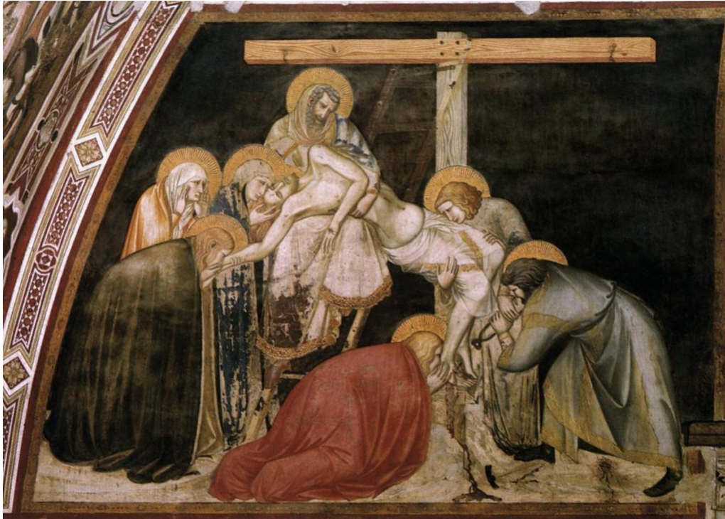
Figure 7. Pietro Lorenzetti, ca. 1280-1348: Deposition of Christ from the Cross, Lower Basilica of San Francesco d’Assisi, ca. 1320. [31]

Seeing anticipatory symbolism in this story, the Seder Eliyahu Rabbah specifically adds that the Messiah will be the very “Son of the Widow” whom Elijah raised from the dead. [30]