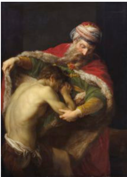
Figure 4. Pompeo Batoni, 1708-1787: The Return of the Prodigal Son, 1773