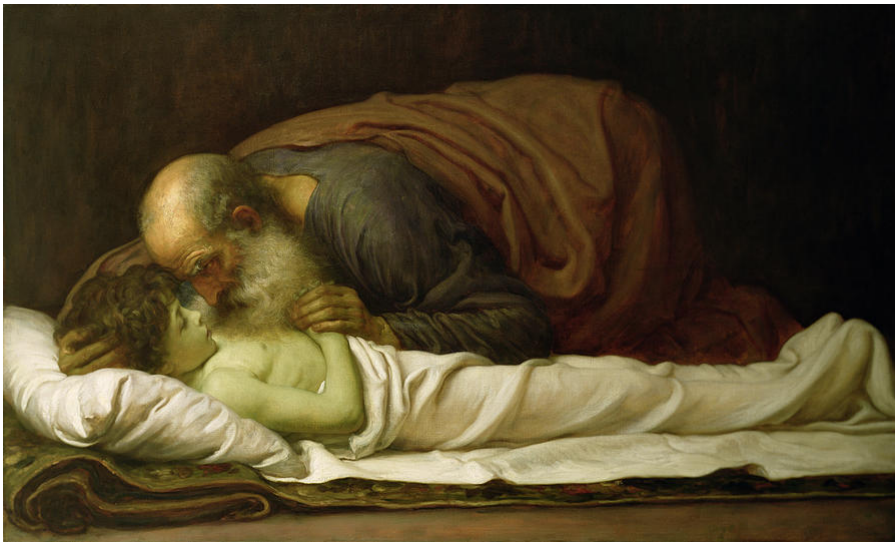
Figure 5. Frederic Leighton, 1830-1896: Elisha Raising the Son of the Shunamite, 1881

Joseph Smith’s words about the gesture of embrace in the resurrection recalls similar symbolism in the stories of Elijah and Elisha, who each employed a similar ritual gesture as they raised a dead child back to life. [20] The more detailed account of Elisha reads as follows (see Figure 5): [21]