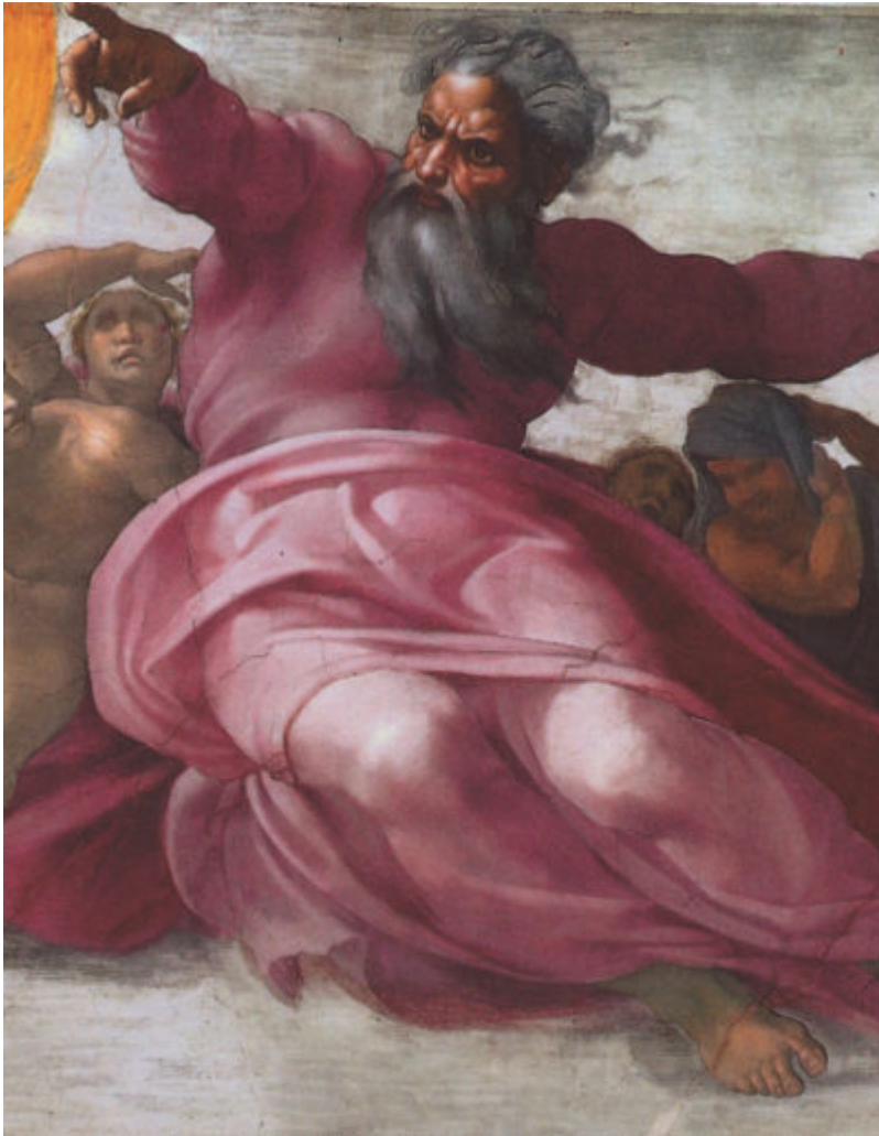
Figure 1. Michelangelo, 1475-1564: Creation of the Sun and Moon, 1511

Question: In reading the description of the seven days of Creation and the layout of the Garden of Eden, there seems to be more than meets the eye. What insights can be gained about these things from understanding the architecture of the Israelite temples?